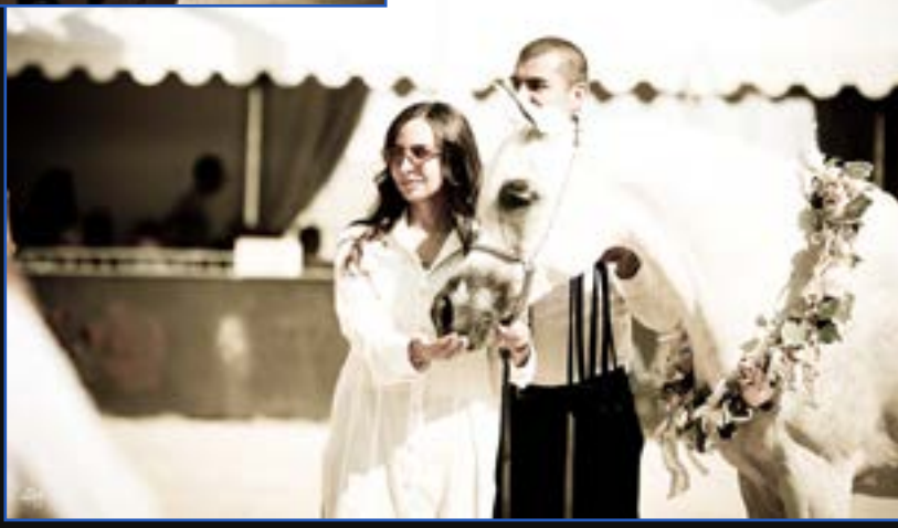
Menton 2019 congratulating the beautiful Noft

Kamila: Why Arabian horses? What is so special about them?